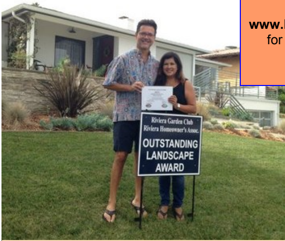
October 2015 – The Marino residence 940 Calle Miramar

Visit www.hollywoodriviera.org for Riviera Landscape awards dating from 1989!