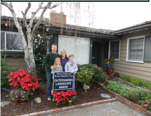
December 2015 – the Nilson residence 5502 Via del Valle