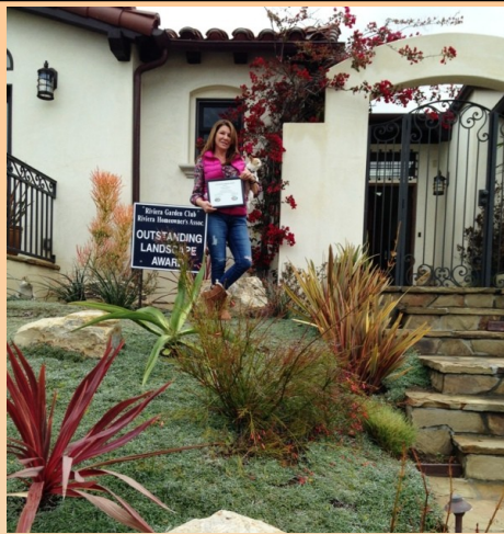
↑ April 2016 – The Panasewicz residence – 111 Via Pasqual

Visit hollywoodriviera.org for Riviera Landscape awards dating from 1989!