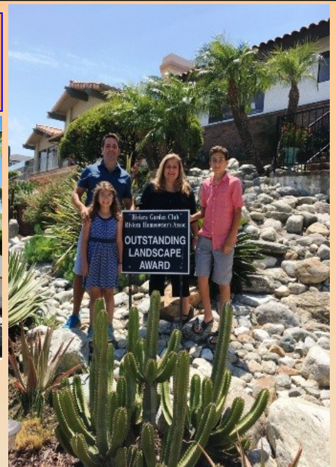
↑ June 2016 – The Antaky residence – 324 Calle Mayor