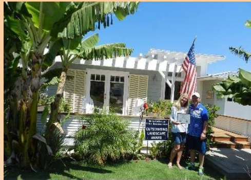
↑ July 2016 – The Lane residence – 515 Paseo de las Reyes