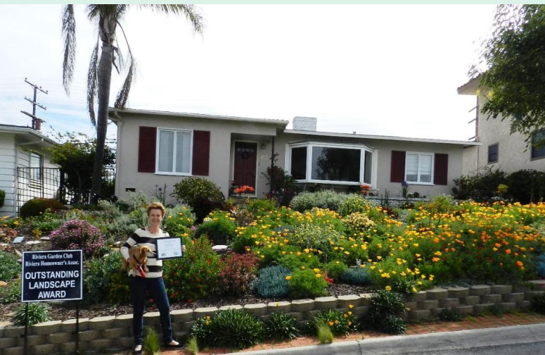
March 2017 – 209 Via Los Altos The Barth residence