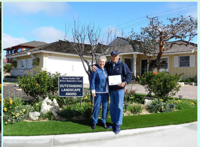
February 2017 – 99 Calle Mayor The Guaglione residence