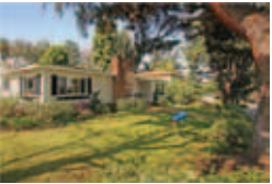
Sold April 2010 ~ $1,000,000 3 Bed & 2 Bath, 2032 Sq Ft Lower Riviera, Corner Lot