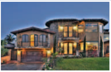
936 Calle Miramar, 2010 Mediterranean w/ Views. $2,499,000