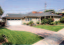
Sold March 2010 ~ $1,050,000 3 Bed & 2 Bath, 1571 Sq Ft Updated Nicely, Partial Views

What Do You Get for $1,000,000 in the Hollywood Riviera?