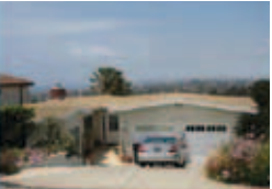
Sold August 2010 ~ $999,000 2 Bed & 2 1/2 Bath, 1697 Sq Ft Panoramic View Home