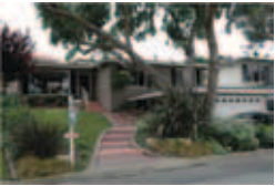
Sold August 2010 ~ $1,039,000 4 Bed & 2 Bath, 1890 Sq Ft Lower Riviera, Updated