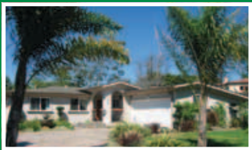
829 Calle de Arboles. 3 Bed, 2 Bath, Remodeled. $939,000