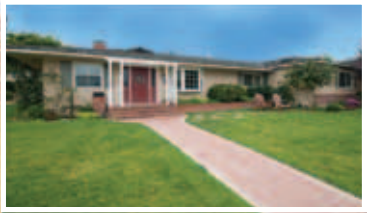
422 Camino del Campo. 4 Bed, 3 Bath, 2494 Sq Ft. $1,199,000