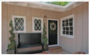
160 Vista del Parque. 5 Bed, 3 Bath, 2286 Sq Ft. $999,000