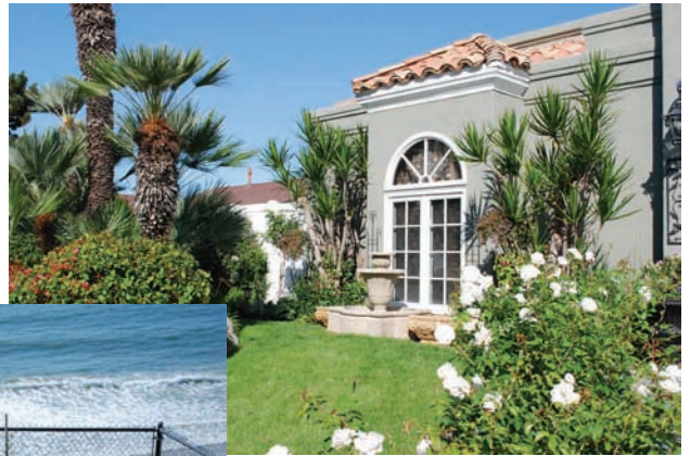
Romantic Hideaway - Joei & Les Sheckman