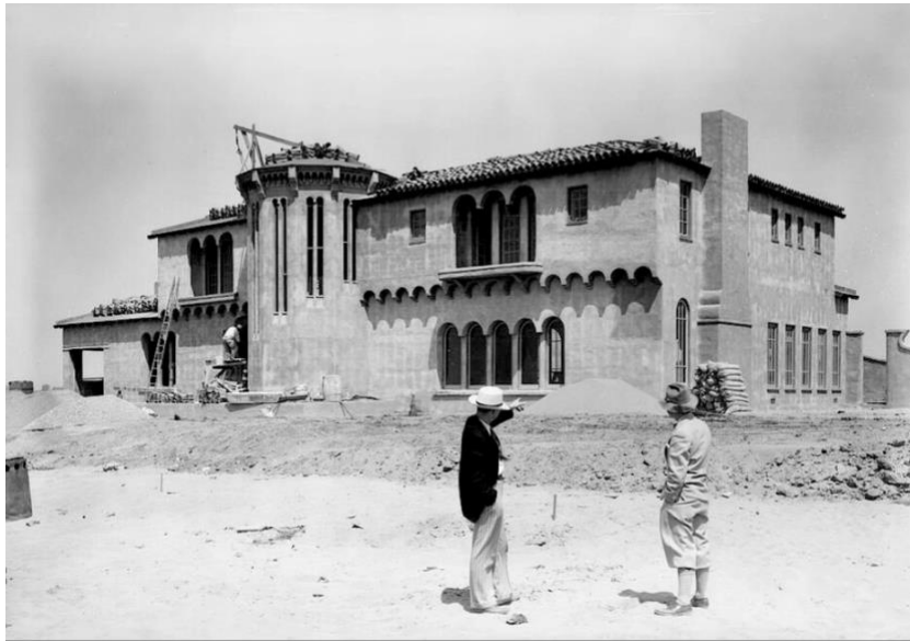
Clifford Reid’s house under construction in 1928.

We’ll share more fun facts on our blog and in future issues of the Riviera Reporter .